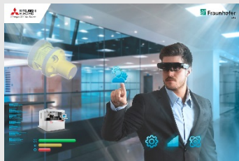
Fraunhofer collaborative exhibit