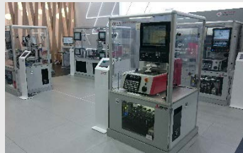
Machining solutions exhibit