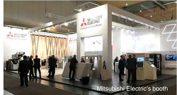
Mitsubishi Electric's booth

Mitsubishi Electric exhibited its latest full lineup of M800, M80, and C80 series computerized numerical controllers (hereafter, "Mitsubishi CNCs") at the Machine Tool World Exposition (EMO Hannover 2017) for 6 days from Sept. 18 (Mon) to Sept. 23 (Sat) in Hannover, Germany. Many customers from all over the world visited the Mitsubishi CNC booth, and we received good feedback regarding the features in our exhibit. From here on in, we endeavor to provide lifetime support to our customer's environment of creation through the international expansion of the Mitsubishi CNC sales and service network.