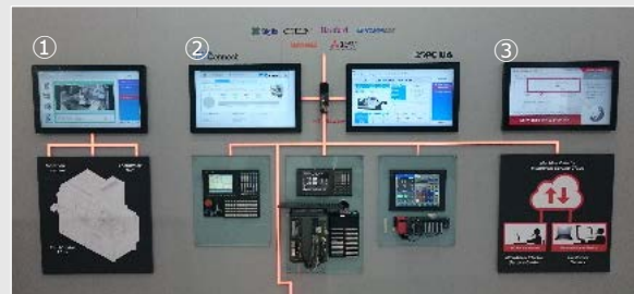
IoT exhibit (overview)