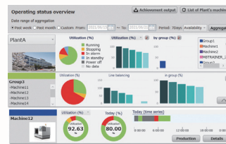
Operating status view

Furthermore, overall monitoring is enabled by also monitoring other manufacturers' machine tools and connecting remote production sites.