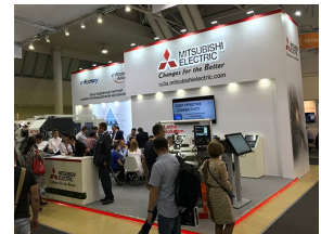
Mitsubishi Electric booth

We demonstrated the lathe solution and the IoT solution including NC Visualizer and the remote monitoring application for which we collaborated with our partners. A large number of people visited the exhibition, demonstrating the increasing demand for machine tools in Russia.