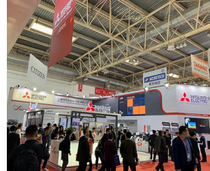
Mitsubishi Electric booth

Mitsubishi Electric participated in China's largest machine tool exhibition CIMT 2019 in Beijing, China. As many as 1,700 exhibitors and 139,000 people from 28 countries around the world were in the exhibition. We demonstrated the direct robot control function, and proposed the automated system solution and the use of the latest drive products. We also explained a broad range of our after-service menus with the display of technical support and repair service examples.