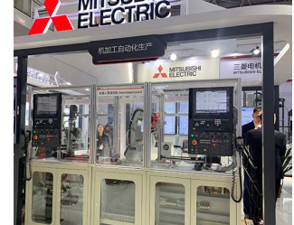
Demonstration of direct robot control