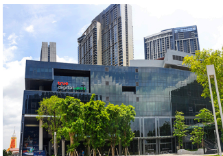
New office in the central Bangkok

MITSUBISHI ELECTRIC FACTORY AUTOMATION (THAILAND) CO., LTD., located in the central Bangkok, has been relocated. The new office was opened on August 26. A new CNC service center was also opened in Korat in April 2019. There are now three CNC service centers in Thailand. We will further strengthen our service system and contribute to the improvement of the customer satisfaction and the development of the manufacturing industry.