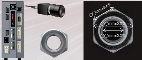
Image processing device