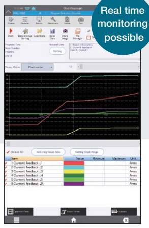
▲ Oscillograph function* * Not available for CR800-R/Q and CR860-R/Q controllers.

Various types of displays and analysis screens make it possible to perform trouble diagnosis and achieve early troubleshooting without a computer.