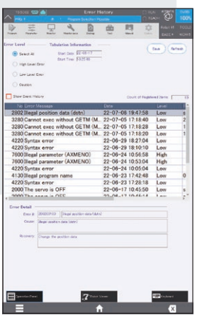
▲ Error history