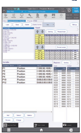
▲ Program monitor